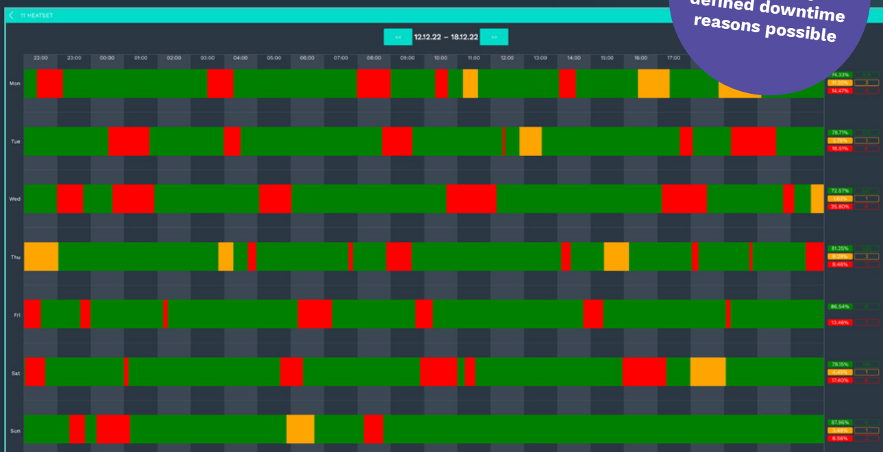
Exemplary display of a milling machine with downtimes and productive times including piece counting

Feedback on individually defined downtime reasons possible